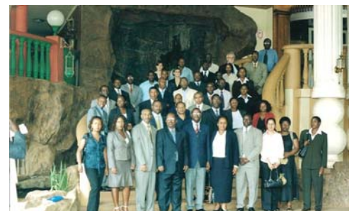
The attendees of the COMESA Workshop, Kampala, Uganda, 13-15 November 2006

For more information on Goulet Telecom International's participation at international events, please contact us at info@goulet-telecom.com .